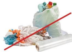
NO Loose Plastic Bags, Film or Recyclables in Bags