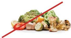
NO Food or Liquids