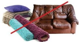
NO Clothing, Furniture, or Carpet