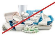
NO Foam Products